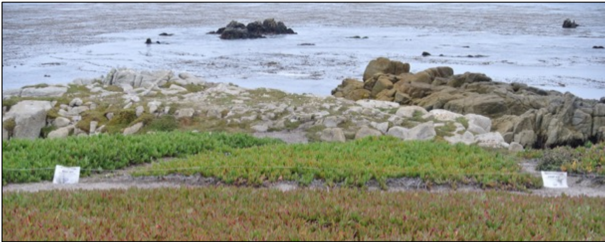
Image 9: Low roping with keep off signs along upper access point to Nest Site A-1 at Point Pinos