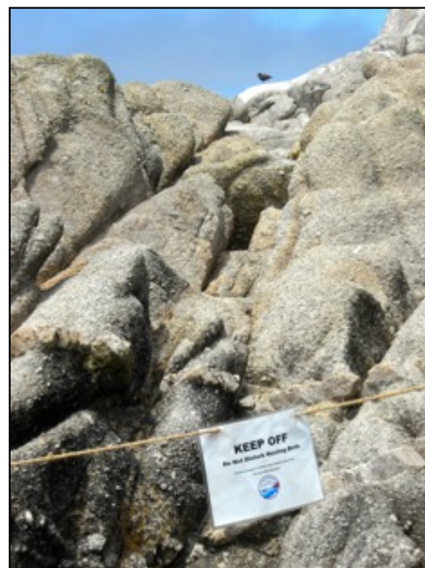
Image 8: Keep off sign on rope at Nest Site A-2 on Point Pinos Islet