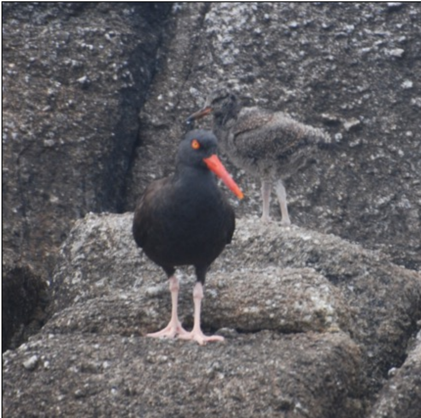
Image 14: A-2 parent with 3½ week old chick on Nesting Rock A-2 at the end of Point Pinos

The exact date when the pair from Nest Site A-2 started incubating is not known. Although nesting behavior was observed earlier, the location of the nest was not found until 31 May. On 16 June, two eggs were found to have been lost to unknown reasons, and a single chick was observed.