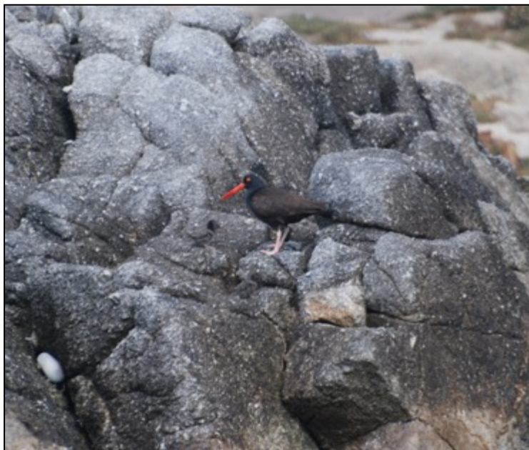
Image 12: Two new chicks blending in with the rock and standing with parent on Nest Site A-1 rock at Point Pinos

In Area A, Point Pinos, the pair from Nest Site A-1 was seen nesting on 24 May. The pair incubated for at least 20 days. On 13 June, one chick was spotted, while the two remaining eggs were still being incubated. On 16 June, two chicks were observed walking around among the dark portion of the rock a few meters north of the nest site. The third egg was found broken. Later that same day, the two chicks were observed down on the wrack among the rocks and sand, while the parents foraged both in the immediate area or flew in with food for the chicks. On 3 July, the remains of one of the chicks were discovered on the rock outcropping about 20 meters from the nest site. A raptor may have been the cause, since the tearing and the skinning to expose the muscle is characteristic of a sharp beak of a raptor.