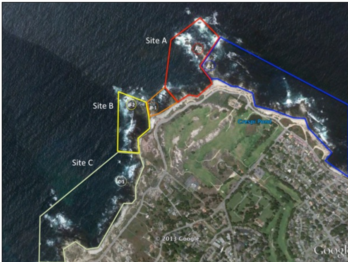
Figure 1- Black Oystercatcher nest sites and the approximate territory for each nesting pair

In the past two years, Black Oystercatcher surveys (2011) and reproductive success monitoring (2012) in Monterey County, California, have encompassed a major portion of the county’s rocky coast habitat. For 2013, Black Oystercatcher reproductive success monitoring was limited to the the Monterey Peninsula from the west side of the Pacific Grove Rock Pile (the rocks just west of the intersection of Asilomar Drive and Ocean View Boulevard-Sunset Drive) to the south end of Asilomar State Beach, all within the City of Pacific Grove, California. This portion of the Monterey Peninsula was divided into three monitoring areas: Area A, B, and C. Each of the three monitoring areas differed in frequency of public use, size, and accessibility.