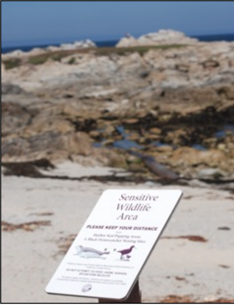
Image 7: Sensitive wildlife area sign at edge of Point Pinos parking area at Area A. Note Point Pinos Islet in background