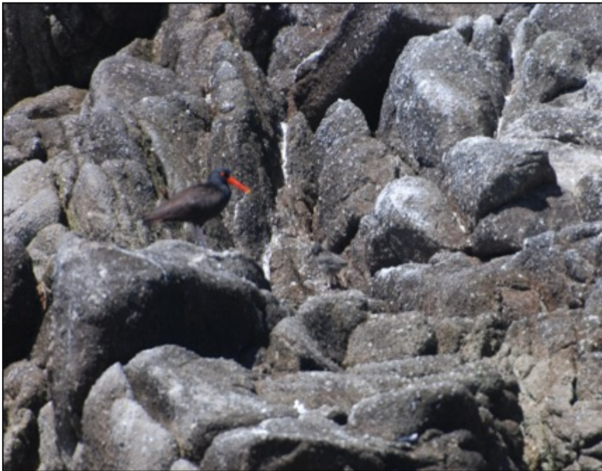
Image 15: C-1 parent with one of three chicks (center) on nesting rock off The Gazebo at Asilomar State Beach

At Area C, The Gazebo, Nest Site C-1 hatched three eggs, and the chicks survived for approximately thirty days. The nest was located on a large rock about 20 meters off the state park observation gazebo, boardwalk and cabled recreational trail. The nesting rock is separated from the mainland rocks by a small four-meter wide channel of water. During the monitoring period, no one was observed trying to climb the rocks during low tide.