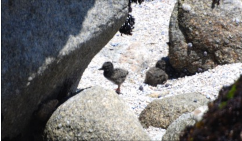
Image 13: Two new Nest Site A-1 chicks among rocks and sand on wrack below nesting rock at Point Pinos

The exact date when the pair from Nest Site A-2 started incubating is not known. Although nesting behavior was observed earlier, the location of the nest was not found until 31 May. On 16 June, two eggs were found to have been lost to unknown reasons, and a single chick was observed.