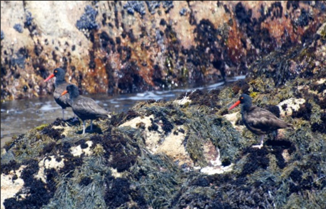
Image 16: A-1 fully fledged chick with parents on wrack at east side of Point Pinos Islet

For the two previous years of monitoring in 2011 and 2012, Area A failed to have a chick successfully fledged. This year's early intervention by roping and signing the two Area A nesting sites redirected human traffic to less critical parts of the area. When they had the opportunity, the Black Oystercatcher monitors spoke to individuals who were walking dogs without leashes and to people who were getting too close to the nest sites. This interaction with the public helps to prevent unnecessary disturbances and may have contributed to the fledging success for the chicks. The roping and signing may have been a major factor to the fledging success by keeping people from encroaching on the Black Oystercatcher nesting sites.