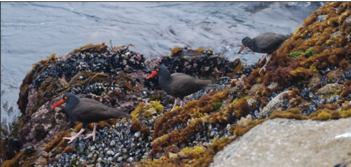
Image 21: A-2 partners with growing chick on mussel bed at western end of Point Pinos Islet