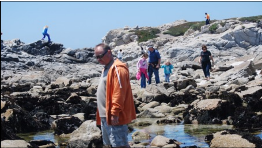
Image 10: People climbing rocks, tide pooling, and walking through Area 1 and near Nest Site A-1 on Point Pinos Islet

While the chicks on Nest Site A-1 and A-2 were growing, the Black Oystercatcher parents on both nests were particularly alert, especially when people brought their dogs out on the islet. Large dogs off-leash were a major concern and put both Black Oystercatcher pairs in extreme alert mode. Apart from people with dogs, the human activities that caused the most inadvertent disturbance included tide pooling, fishing, and photography.