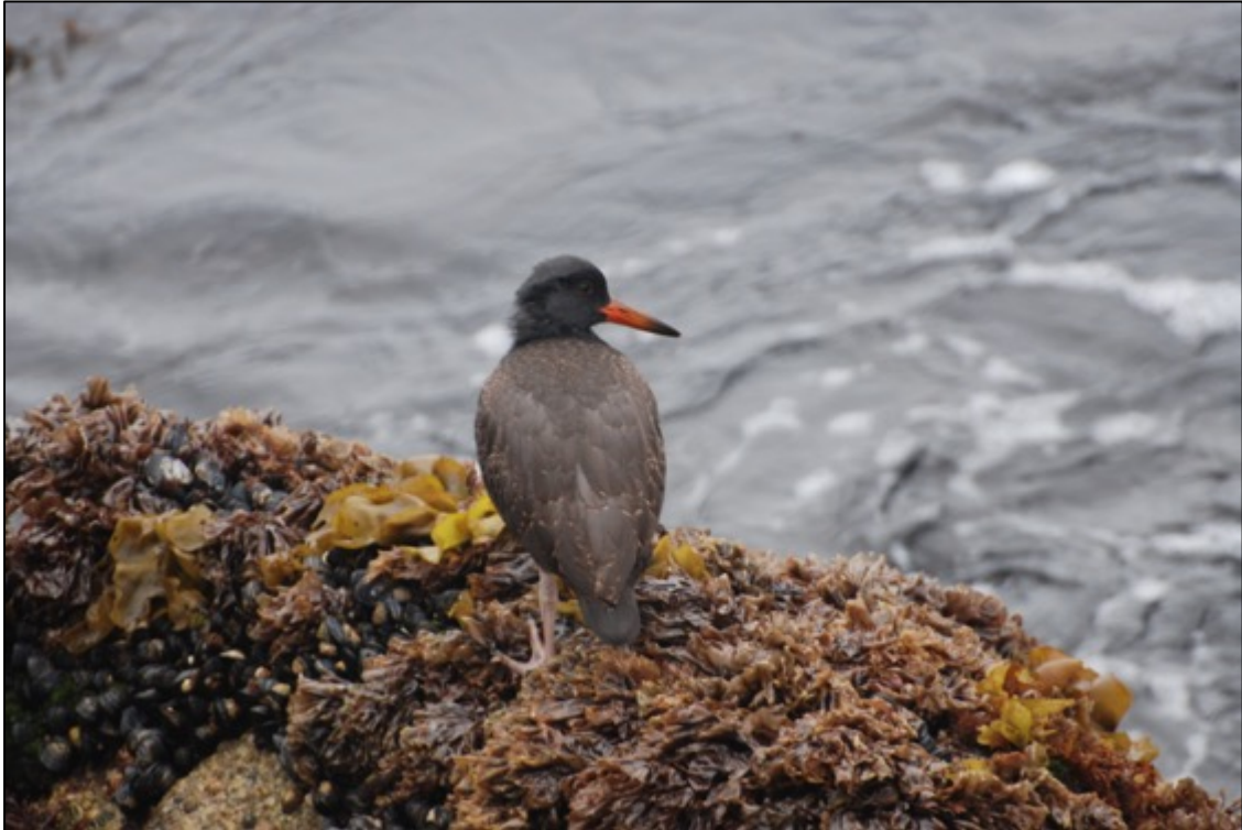
Image 18: A-2 chick about to fledge at outer end of Point Pinos Islet