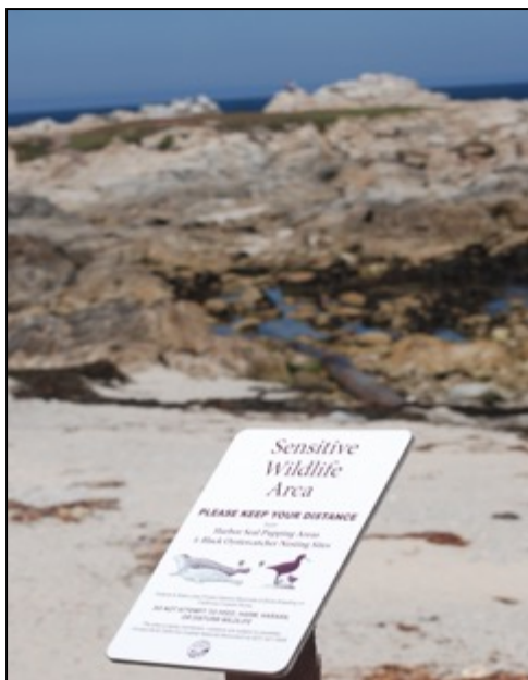
Image 7: Sensitive wildlife area sign at edge of Point Pinos parking area at Area A. Note Point Pinos Islet in background

The Area C-1 nesting pair had the least observed human disturbance. The loss of the three C-1 chicks is not known, but due to the location of the nest, the reasonable explanation for their disappearance points to predation. On two occasions a Red-shouldered Hawk ( Buteo lineatus ) was seen perching on a small pole near the recreation trail, but it was never observed flying above or perching on nesting rock. The C-1 pair was seen copulating once after losing the chicks, but the pair was not seen re-nesting so late in the season.