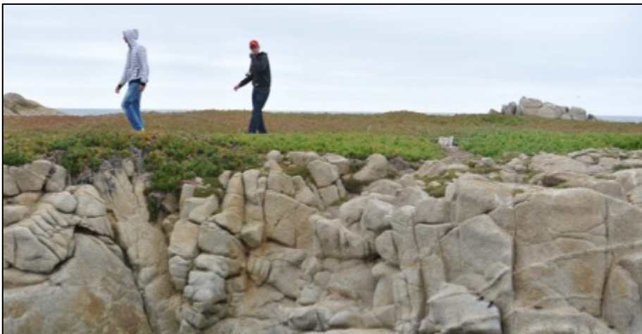
Image 11: People walking in Area A near low rope and sign near Nest Site A-1 on Point Pinos Islet