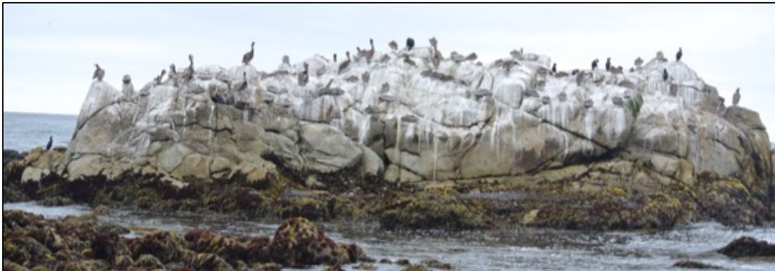
Image 4: Nest Site B-2 at South Gull Roost in Area B; Note roosting Brown Pelicans and a few cormorants

Area C - The Gazebo: Area C starts at the intersection of Lighthouse Avenue and Sunset Drive and runs to the south end of Asilomar State Beach at Spanish Bay. The area has a state park observation gazebo and boardwalk, plus a cable-lined hiking trail along much of the coastline of the monitoring area. The monitoring area has fairly high foot traffic, but public access to the rocks is much more limited than in the other two areas. This monitoring area has a relatively smaller surface area exposed above high tide. The one Black Oystercatcher nesting site in this monitoring area, Nest Site C-1, is located on a stand-alone rock that is fully surrounded by water during all tides.