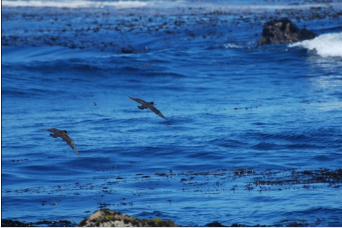
Image 17: A-1 fledgling flying with parent following east of Point Pinos Islet