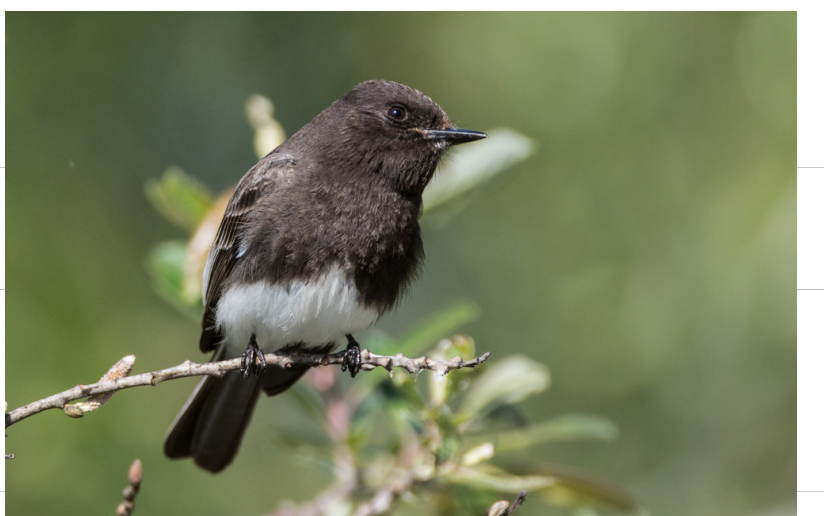
Black phoebes are one of the most conspicuous and widespread sights on field trips throughout California's Central Coast.