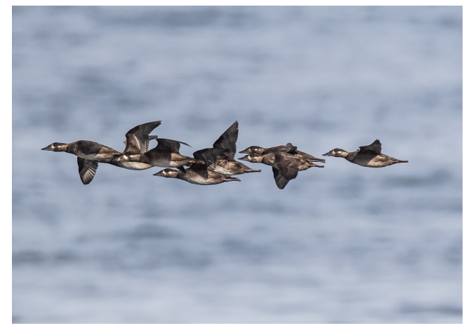
A migrating group of surf scoters, as seen from Point Pinos during Monterey Audubon's annual Seawatch Initiative.

Earlier this year, the California Coastal Commission finally approved the start of construction, in spite of the US Fish and Wildlife Service's concerns over the project's legality. (The building site sits on federally designated Critical Habitat, where snowy plovers have been documented nesting.) Despite a "ground-breaking ceremony" covered by the local press in February, major construction was not yet apparent as this newsletter went to press.