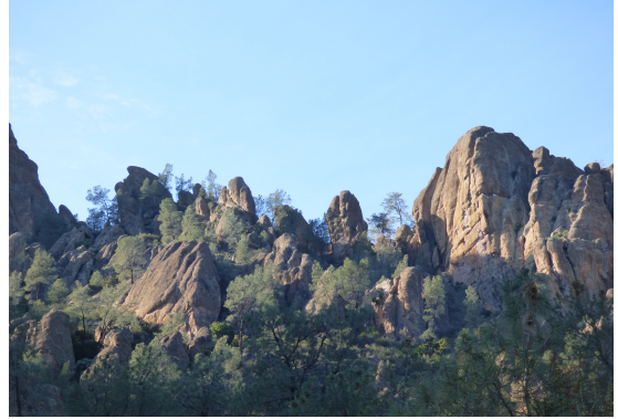
These unearthly volcanic rock formations are one of the hallmark features of Pinnacles National Park.