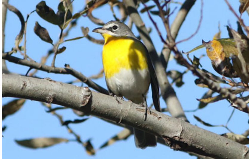
The yellow-breasted chat who wintered at Laguna Grande.