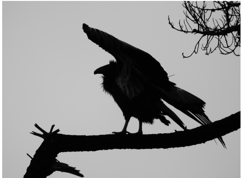
Because of their tremendous wingspan, perching in trees actually poses a risk for condors, and is done only in abnormal conditions. This one, photographed in the Carmel Highlands in 2015, was disoriented by a storm.

So the next time you’re lucky enough to glimpse a condor over the Santa Lucias, don’t immediately whip out the camera. Take a moment to notice the environment: is it sunny? What time of day is it? Is there a breeze? Imagine the condor going through the same checklist, and making the potentially risky decision to take to the skies. And then snap the picture.